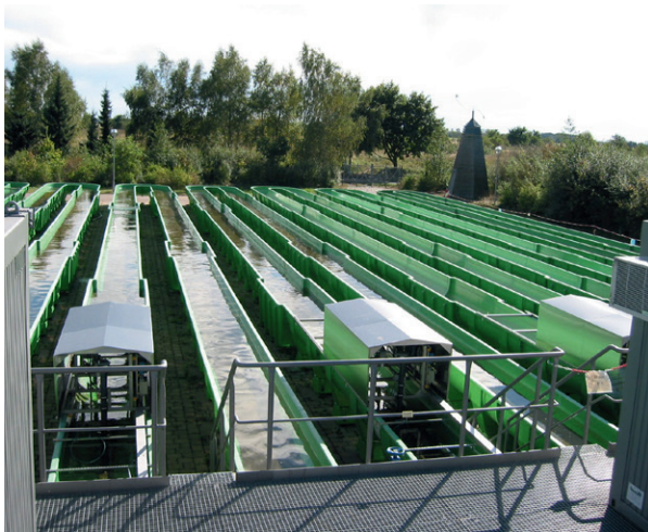
Flow and pond simulation facility of the German Environment Agency in Marienfelde

In addition, the project team will quantitatively predict the movement and distribution of microplastic particles in watercourses and the wastewater system. The project partners will integrate the results into a software that simulates complex, application-oriented cases. For this purpose, a commercially usable simulation code will be developed that limits the selection of suitable sampling points. At the end of the project, a market-ready procedure for efficient and reliable microplastic sampling should be in place. This is intended to simplify the evaluation of questions regarding microplastics for legislators and to provide a basis for strategies and regulations that help to reduce microplastics in the water cycle.