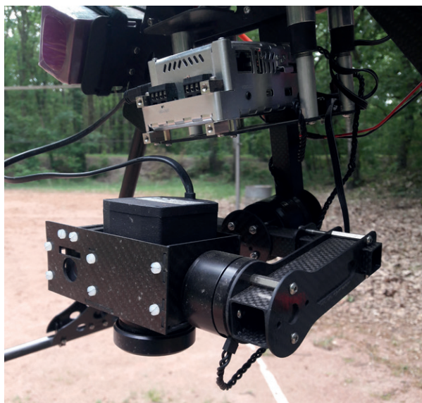
Researchers are testing various sensors and cameras for detecting and monitoring plastics in the environment.

Within the project, researchers seek to further develop novel remote sensing methods to comprehensively detect